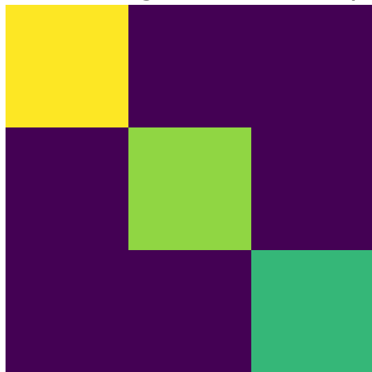
Tensor (diagonal anisotropic)